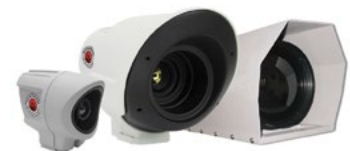
Fixed thermal cameras are ideal for 24/7 wide area threat detection tasks, especially when combined with video analytics.