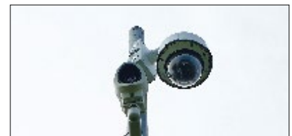
Sii AT is an outdoor thermal security camera used for observing and monitoring sensitive sites.

In an effort to improve safety and reduce crashes, Israel Railways embarked on a major project to identify threats and provide alerts in real time. Continuous recording and storing videos of train-road crossings would enable the railway's Safety Control Room's operator to monitor train-road crossings at all times and in any weather conditions, while maintaining low project costs and total cost of ownership (TCO).